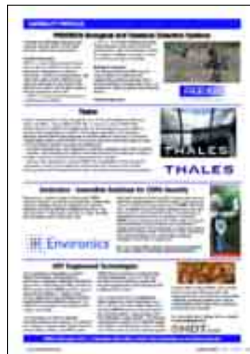
Capability Profile appearing in the magazine

Website Advertising: Generate traffic to your website by advertising on the www.cbrneworld.com website. Details on request.