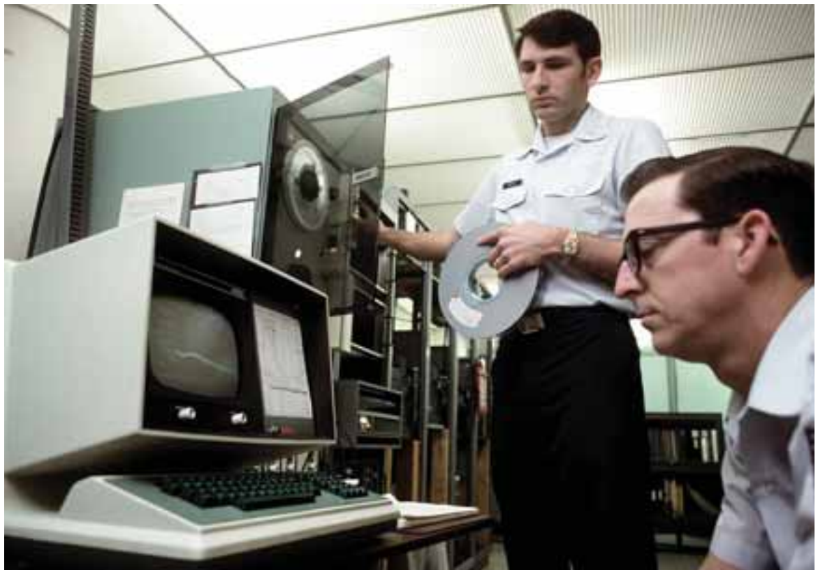
Data on legacy items/incidents is not always going to be in a format that is easily accessible

calcium and Radium are chemically exchangeable, the water was a carrier. We also learned why there was another spot 20 meters away. The storm roof gutters had failed over the intervening years, water had migrated under the concrete walkway and the same kind of Radium for calcium migration had allowed the Radium-226 to migrate within the sidewalk.