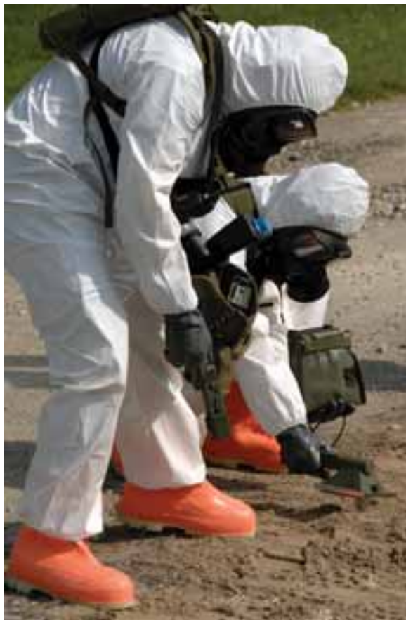
Radiological incidents need not always come from terrorists

Still wary of using an expired meter, I returned to the Health Physics building,