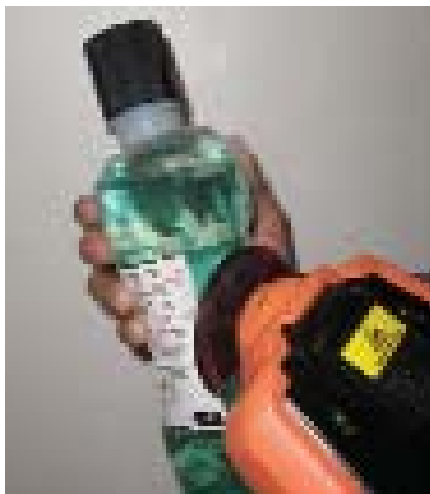
Glass, plastic, coloured glass and mixtures are all in a days work for a raman spectrometer.

While both Smiths and Ahura have seen significant interest from customs and security officials, the real drive has come from more traditional users. "We have sold more than 300 units in the 15 months of the product's