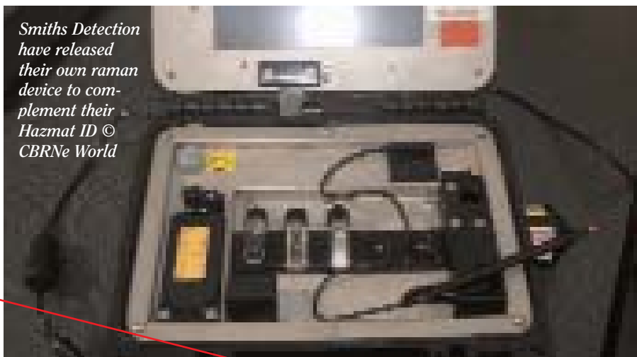
Smiths Detection have released their own raman device to complement their Hazmat ID

While raman might not be the tricorder, presumably it could have a greater role than just chemical identification. Currently work is being done on biological lasers and fluorescence where certain proteins, such as NADH, fluoresce under a laser indicating that it might be a biological attack. Surely it would be simply a matter of changing the wavelength to allow First Defender to do the same? "In addition to chemical identification, raman technology can also be used to identify biological specimens," said Doug Kahan. "Its effectiveness has been validated in laboratory settings, and current research and development activities are focused on evaluation of various wavelength lasers and pre-separation techniques for amplifying desired signals and filtering undesired ones. Highly specialised software for analysis and codification of spectra from various species and sub-species is also required. While the development task is challenging, particularly given the ubiquity of proteins and the complexity of living organ-